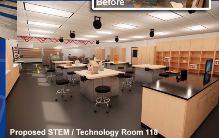
Proposed STEM / Technology Room 118