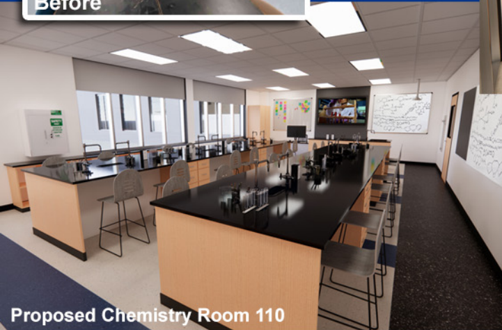
Proposed Chemistry Room 110