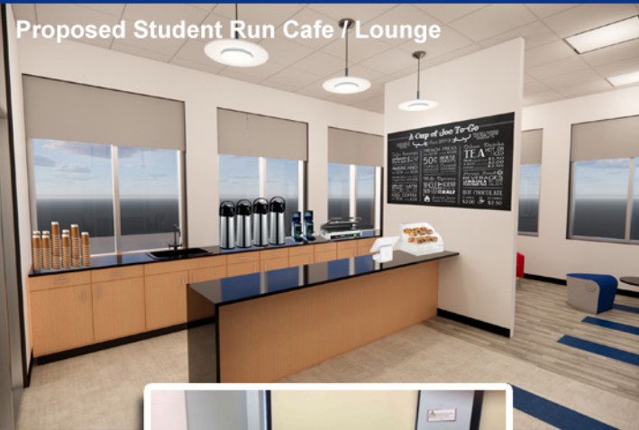
Proposed Student Run Cafe Lounge